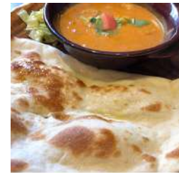
Katchar Batchar : Butter chicken curry set

We've written of - and you've almost certainly tasted delicious Japanese curry; however, the delicacy that is a meal at Katchar Batchar is in a class of its own. A noted Michelin restaurant situated in, the culinary mecca of Otsuka, Katchar serves up innovative take on Indian curry. Though we love the heavy cheese nan at nearby Yappari India, we adore even more the much more elegant cheese kulcha - thin yet no less creamy. As for curries, our favorite is the spicy mutton curry, though you can't go wrong. Gone are the convenient pandemic lunch hours and the chef once again vanishes on the occasional trip to India for research; but the curry here is more than worth the effort!