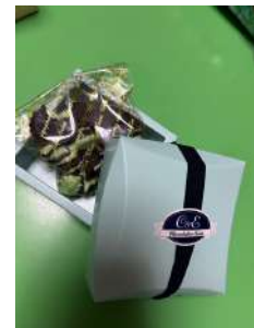
Chocolatier Erika Shirogane : Mint Chocolate box

Chocolatier Erika in Shirogane - Find the mint color wall