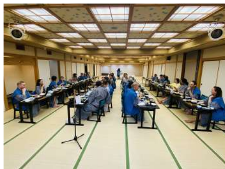
Onsen Confidential 2022. 9. 10 - 9. 25 http://onsenconfidential.com