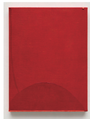
Paulo Monteiro "untitled" 2019 Oil on canvas 38x28cm