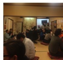
Enkai Party 2018