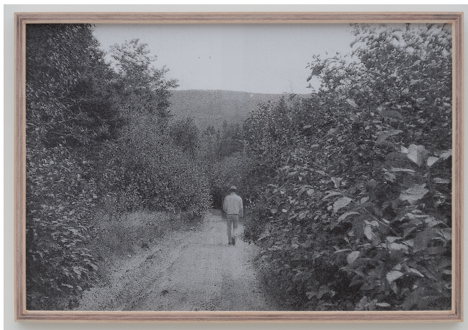
Yuki Okumura 29,771 days - 2,094,943 steps 2019 Scanned and partly overlaid published photographic image; archival pigment print on paper image: 38x56cm, frame: 40.1x58.3cm