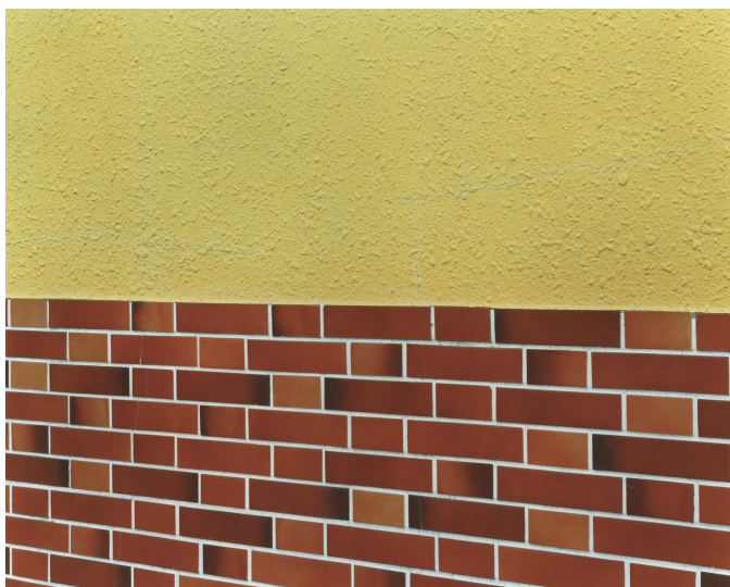
Takashi Yasumura For Sale 2015 c-print mounted on aluminum image : 50.8x60cm frame : 53.5x64.8cm Series of 1/1